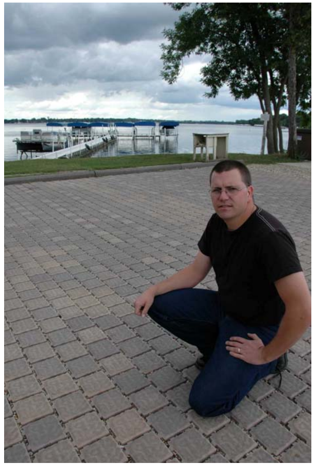
Permeable pavers cover this parking lot and eliminate direct runoff to East Okboji Lake.

The below ground rock base with a subdrain under a permeable pavement. Water will percolate into the surrounding soils if it can. If it can't it will move to the subdrain and be slowly released.