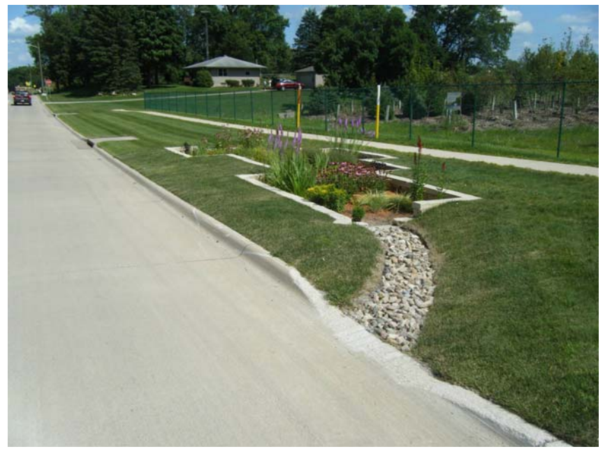
A rain garden in Coralville takes street runoff through a curb cut. Note the storm sewer intake in the background. Most of the time dirty runoff won't get to the storm sewer.