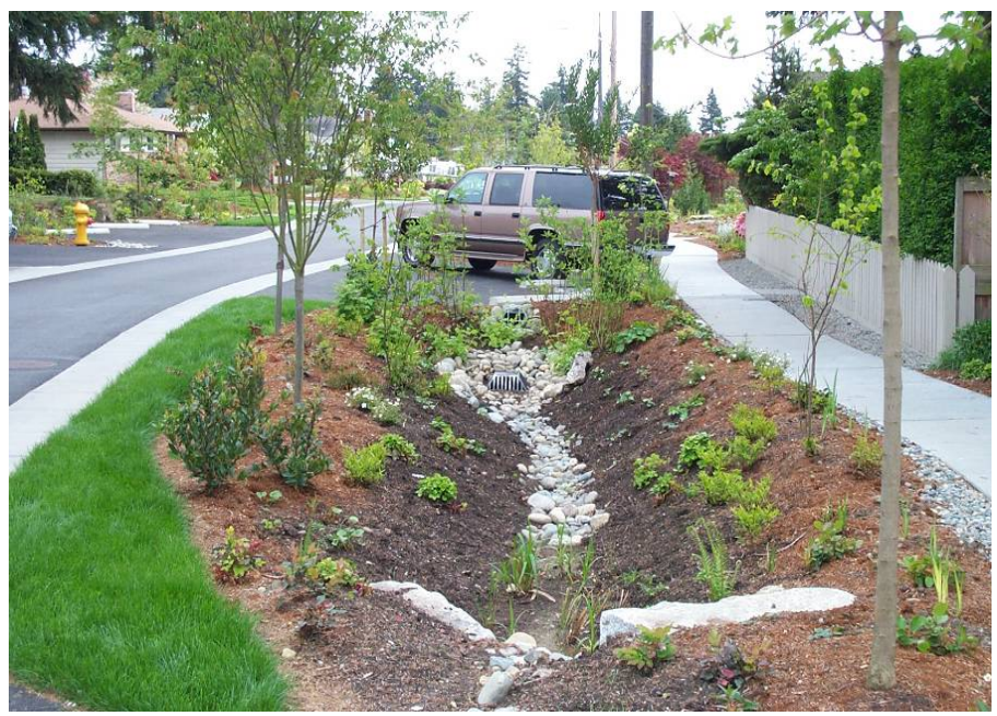
A bio-swale in place of curb and gutters and storm sewers.

A rain garden in the back of Woodard Insurance - a downtown business in West Union. Roof runoff enters the rain garden through the downspout (seen in the lower left corner of the picture). Permeable pavers are to the right of the rain garden and a rain barrel takes roof runoff from the garage in the background – making this a three practice project.