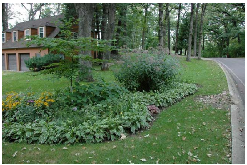
A rain garden in Okoboji takes street runoff through a curb cut. Runoff that used to go directly into West Okoboji Lake now gets infiltrated, cleaned, and slowly released – as groundwater flow to the lake.